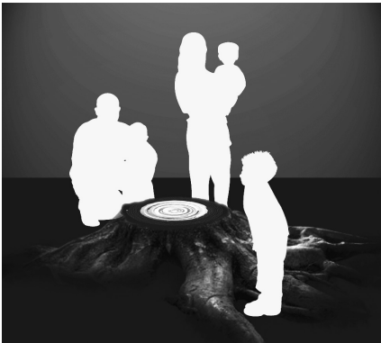
Fig. 18.4: Dendrochronology.

humidity and so on. Each minute of human activity is recorded in this dendro-graphic ring in real time. Dendrochronology helps to deliver the eco-message and serves as a constant reminder that whatever we do, there is an environmental impact which is faithfully recorded by nature. This installation will be implemented through a projection within the “Tree of Life” area on a tree-stump. The tree-stump can be a seating area for story-tellers during events (see figure 18.4). Environmental data will be collected with devices in real-time. This tree-stump will be under the “Tree House” in between the Active and Passive Zone.