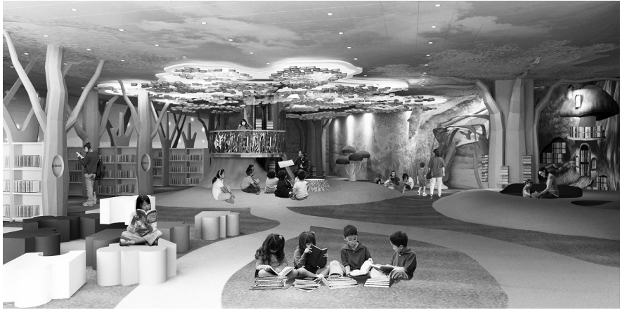
Fig. 18.2: Interior of “My Tree House” – An integrated green design concept. © ADDP Architects LLP.

Display and the Shadow Play Wall. The Passive Zone will contain primarily the collection for quiet reading, e-reading kiosks and section. The Green Activity Areas will be a space with modular furniture to allow flexibility of usage for librarians and partners to organize specific programmes such as handicrafts and science experiments. Their products or results could then be displayed in the Handicraft Display Section. The stage would be used for storytelling, performances and events for children by children.