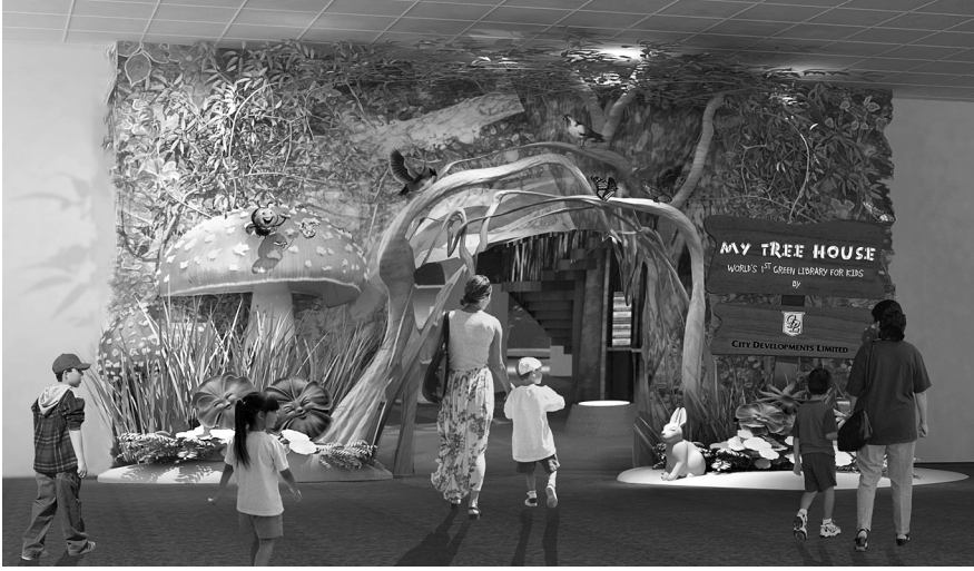
Fig. 18.1: An enchanting and magical entrance to “My Tree House”. © ADDP Architects LLP.

into a magical forest (Figure 18.1). The second focal point will be the “Tree House” itself that is strategically located at the centre of the area.